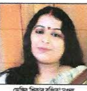
ডেঙ্গি রোগের শিকার হওয়া মৃত্যুপ্রাপ্ত রোগীর ছবি।

আজকালের প্রতিবেদন মৌলিকভাবে এক গৌরবপূর্ণ পরিবারের মেয়ে মৃত্যু হয়েছে।